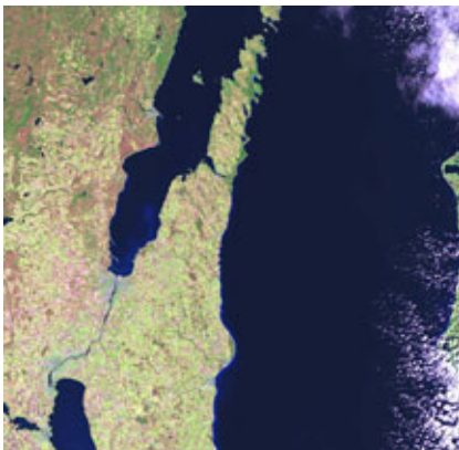
Landsat 7 Satellite Image

The goal of WisconsinView is to enhance the coordination of remote sensing data access and use across the state. Towards that end, we seek to expand our consortium of participating institutions.