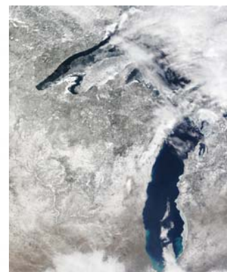
Satellite Image of Wisconsin

WisconsinView Space Science & Engineering Center 1225 W Dayton ST, FL 12 University of Wisconsin-Madison Madison, 53706