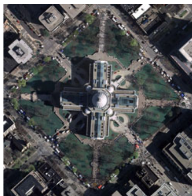
Air photo of the State Capitol

The Sole Source – WisconsinView is the only free online source of statewide aerial imagery of Wisconsin. We also collect and process daily satellite imagery. Between 300 and 800 GB of data are downloaded each month. The variety of imagery we provide is used for an even greater variety of purposes from land record updates, to recreational uses, to water quality monitoring, to farm field evaluation, to environmental consulting.